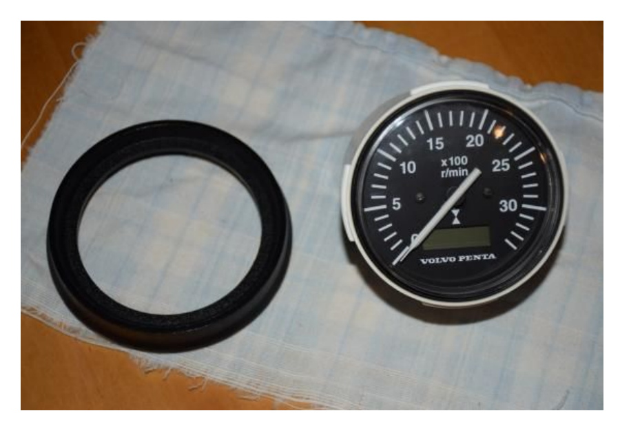
2. Rotate the outer ring counter-clockwise from the tachometer unit.