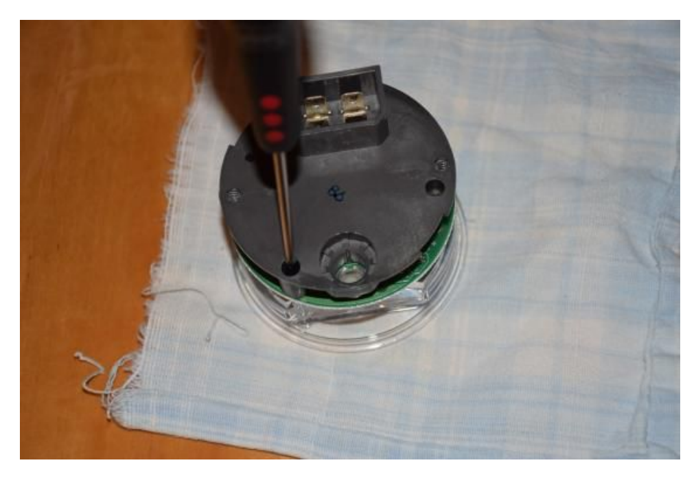
5. Swap the Tachometer side again. Remove the screws by a screwdrive