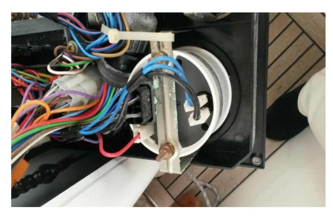
1.Detach the tacho from the dashboard by the 2 brass-nuts holding the bracket. Pull the taco forward until you have it in your hand.

Instructions how to change the Volvo Penta Tacometer LCD display provided by Marineparts.eu